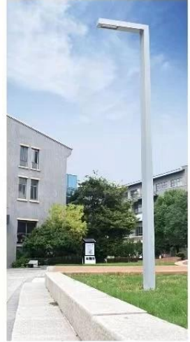
参考颜色 Reference color :RAL 9009 ■ RAL 7015 ■